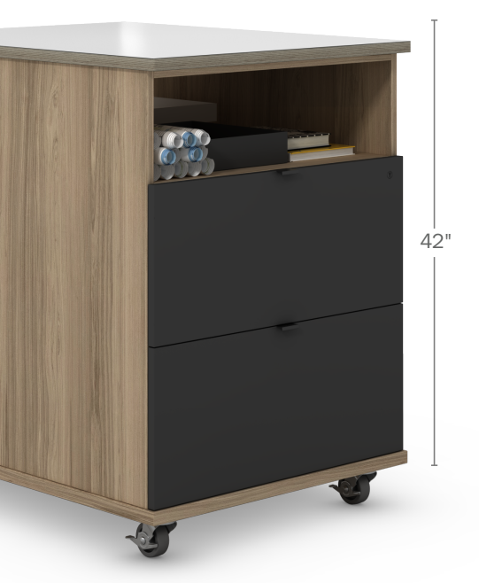
4-file with pass-through shown in Fawn Cypress finish.

Work Island is a modular system created to provide efficient, accessible locker placement and other storage as well as an area for team members to meet or take a moment away from their work stations.